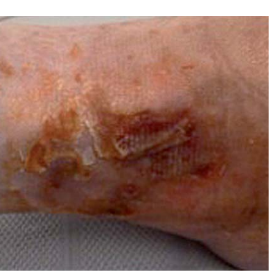
Figure 1. Unhealed skin tear on the patient's lower shin.

In this case, a trauma to the shin resulted in a wound that required exudate management and an antimicrobial dressing.