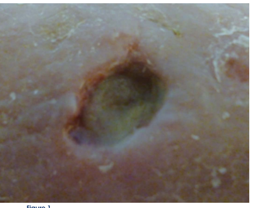
Figure 1. The ulcer at presentation showing slough in the wound bed.