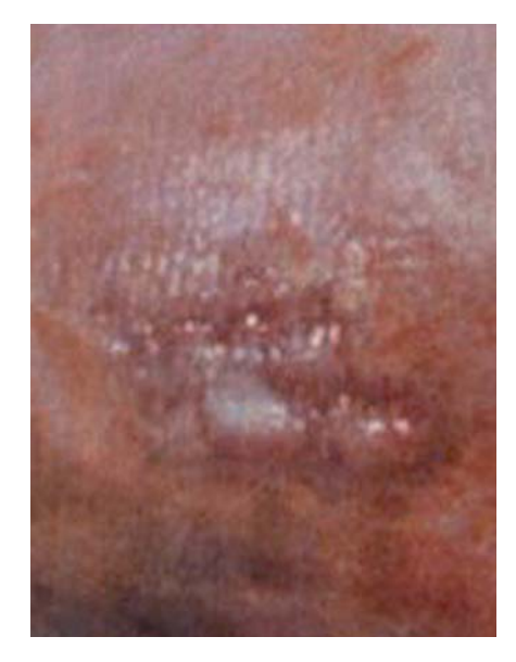
Figure 2. The wound reducing in size as treatment with Actilite Protect progresses.

This patient was a 74-year-old woman who was being cared for in a nursing home. She had an unhealed skin tear on her lower shin caused by a trauma to the leg that had occurred four weeks previously. Before the evaluation it had been treated with a foam dressing that was changed every two days.