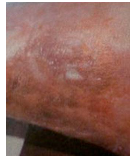
Figure 3. The wound demonstrating growth of granulation tissue and further reduced size.

After two weeks of treatment the clinician rated the product as '2' on a scale of 1–5 for ease of use, where '1' was 'very easy' and '5' was 'very difficult' — the dressing was also found to be easy to apply and remove (both rated '2' on the five-point